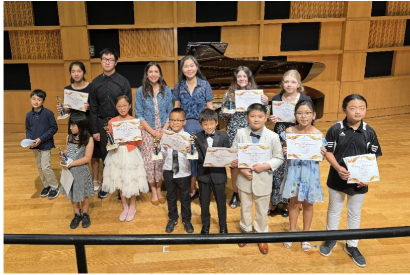
Spring Adjudicated Performances, Bloch Hall, May 4, 2024