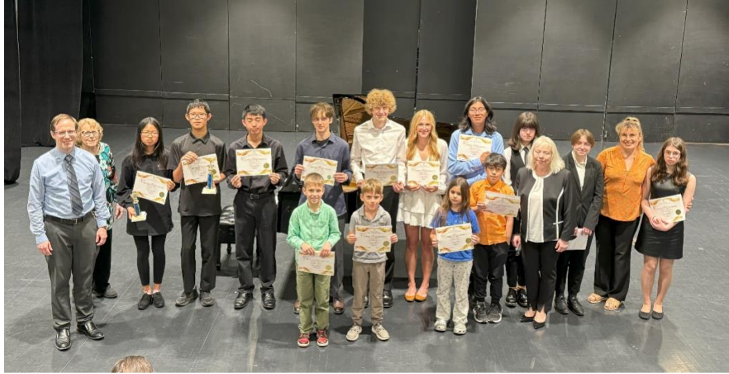
Spring Adjudicated Performances, Falbo Theatre, May 4, 2024