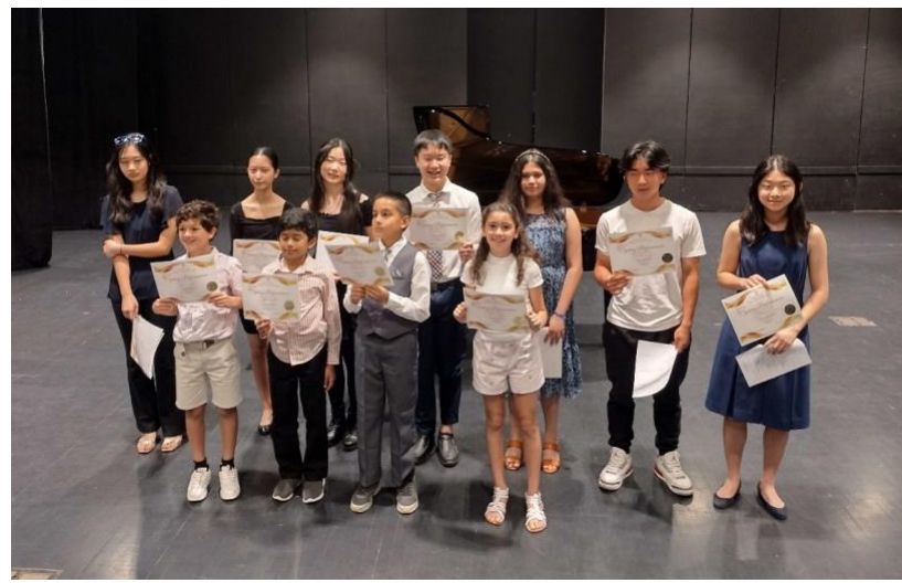
Spring Adjudicated Performances, Falbo Theatre, May 4, 2024